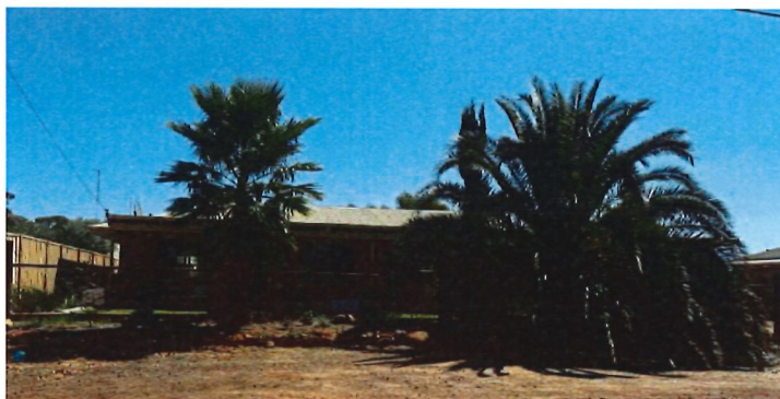
Above: 19 Hesford Street