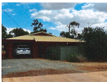
Above: 59 Russell Street