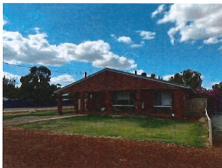
Above: 50 Russell Street