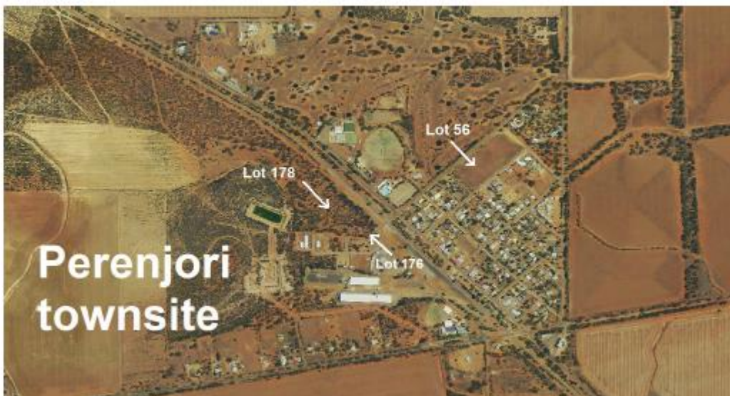
Diagram 1: Identified Lots

Initial discussions with LandCorp indicated that the Lots identified would qualify for consideration under the RDAP. If an application under this program was successful this would result in LandCorp meeting the subdivision costs, e.g. road construction, power, water, surveying, settlement, fencing with the Shire having some ability to provide in-kind assistance where it had the necessary experience, equipment and capacity.